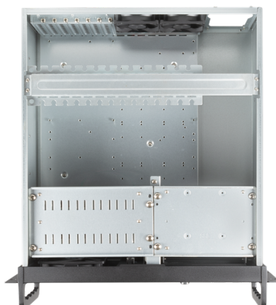
SUPERIOR | OPEN